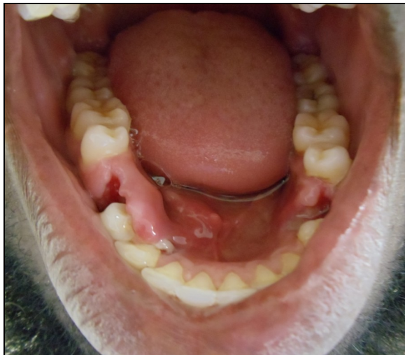
This patient did not know his jaw had been broken in a motorcycle accident nine days before he came to the WISH clinic.