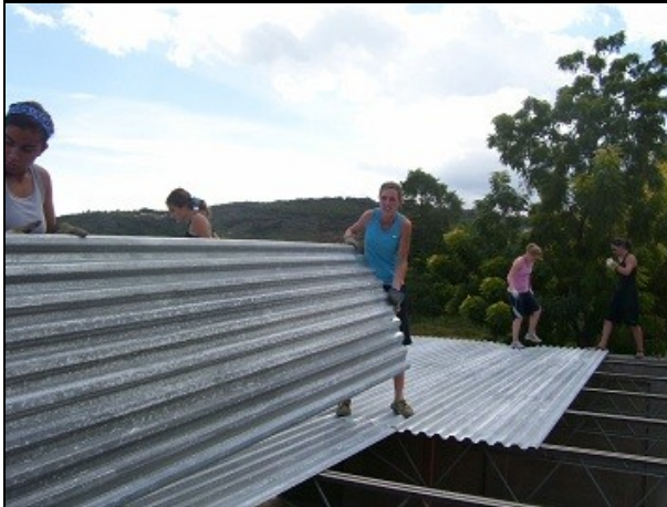
Rising to new heights, the YWAM crew put corrugated steel on the

Three team leaders and nine students spent three weeks in the village sharing their spirit in a variety of ways. They were involved with the children's choir, and the saline school and orphanage children enjoyed playing games with the group. They even put steel on the upper level of the new library building and helped with community beautification by picking up trash along the road. When the Breezy Sea boat had to be taken out of the water for repairs, the team gave the bottom of