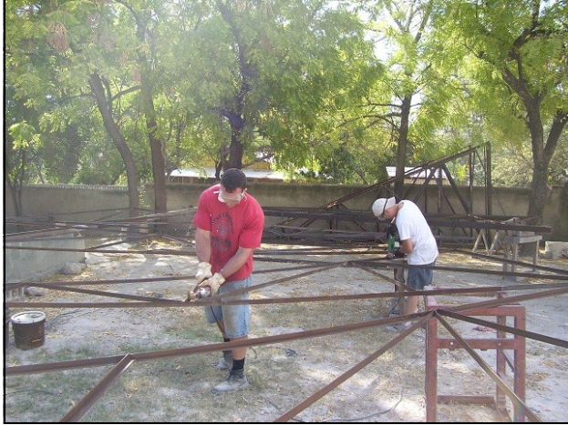
Trusses were cleaned and painted by the Pennsylvania team.

people want to work so they can buy food.