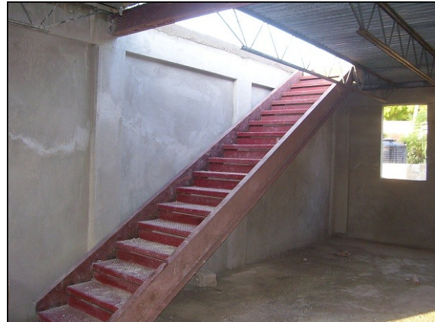
Going UP! Stairs were constructed just in time for the next team to pour the floor for the second story of the new library and community resource center.

Concrete experts directed the pour for the second story floor and started to pour some of the columns for the second floor walls. God's timing for sending workers was perfect to complete the stairs before the floor was poured.