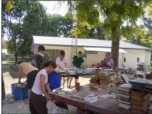
The ladies from Sandy Lake Wesleyan church sorted, cleaned and catalogued books in anticipation of the many villagers who will use this new facility.

lated that "it was amazing to see how many men showed up, hopeful to have work for a day when we began to pour the floor at the library. They came ready to work, without us ever asking for extra help. They were paid less than $8 US and I was greeted with applause and hugs as I gave out the money to the men." Rod also noted that it was a sad reminder of how few jobs there are and how many