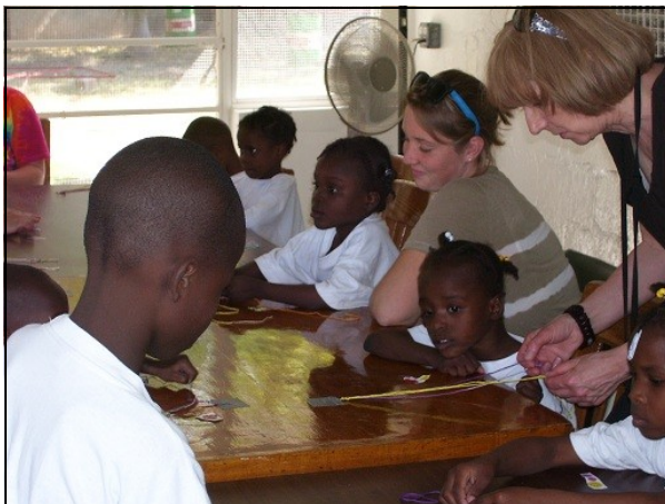
Orphanage children enjoyed a visit to the WISH mission complex where they could play in the yard and make crafts on the porch.

play games. The current location of the orphanage is on the side of a mountain where there is no safe play area for the children. The kids on the saline were also excited to receive shoes and hygiene kits from the team. Sadly, there are just never enough gifts for everyone.