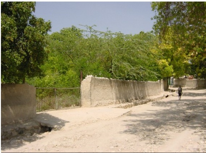
New library site is inside these gates.

Recently, an all-French high school and elementary school in Sarnia, Ontario, Canada donated thousands of books, all in French, including encyclopedias, medical reference books, text books and classic literary works for our library on LaGonave. The hospital nursing students and staff will benefit from the medical reference books. Teachers and pastors will have resources for lesson plans. A children's story-time would surely captivate the attention and motivate those who are yet unable to read. What better way to demon-