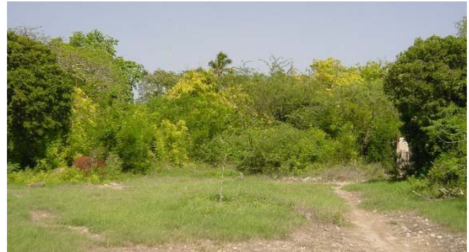
The site for the new library is just down the road from the WISH mission center near the morenga and date palm gardens. It's perfect for the 40' X 60' structure.

Through the years, it became apparent that the location of the original building, on one of the busiest and dustiest thoroughfares from the wharf to the village market, was less than satisfactory. Although the books were kept on shelves draped with heavy plastic curtains, the dust permeated everything. It was not possible to seal and air-condition the building since it was located too far from the generator to provide adequate power. The flat roof developed many age-related problems and recent earth tremors opened large cracks in the foundation and walls. Sadly, WISH had to discontinue use of that building as a library. However, the